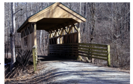
The newly constructed covered bridge across Naked Creek is a replica of a traditional railroad cover.

After 65 years in operation, the railroad was forced to fold. The trail and two former Virginia Blue Ridge Railway steam engines on display in a New Jersey railroad museum are the only remnants of the railroad's illustrious past.