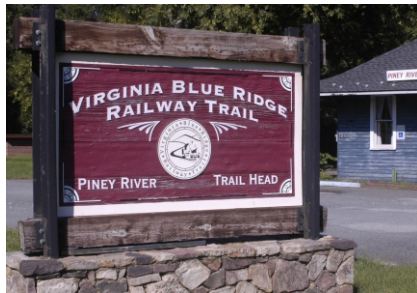
The Piney River trailhead sign is framed by track crossties and rails salvaged from the railroad. Part of the trail is suitable for people with wheelchairs or walkers.

Added enhancements are nearing completion under the supervision of Nelson County. Besides restoration of the Piney River train station that includes accessibility