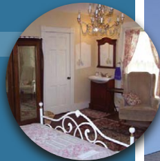
Rock Mill Farm Bed & Breakfast