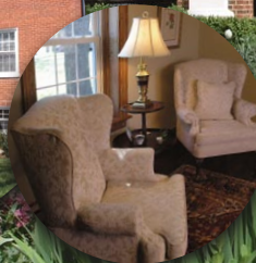
Florence Ellston Inn at Sweet Briar College