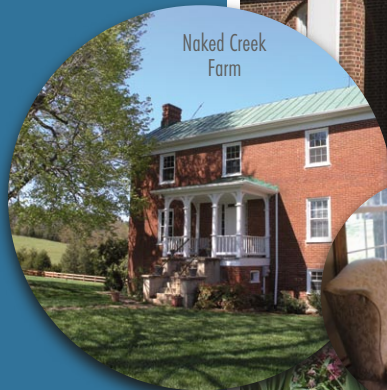
Naked Creek Farm